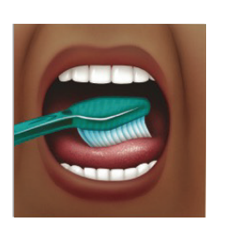
Gently brush your tongue to remove bacteria and freshen breath