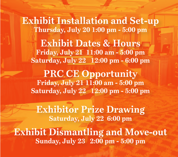
Exhibit Installation and Set-up Thursday, July 20 1:00 pm - 5:00 pm

Lunch Snack FRIDAY & SATURDAY, JULY 21 & 22 12:00 pm - 1:00 pm